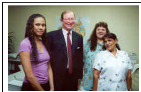
Federal Attorney General, Daryl Williams with staff of the NT AIS in Darwin.